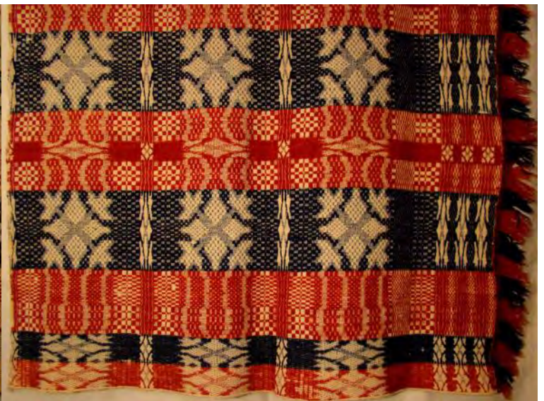
Red, Blue and White Star Work Four Tulips Pattern with Pine Tree Border