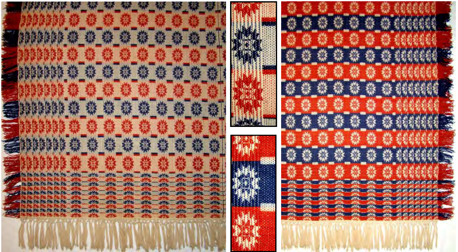
Red, Blue and White Star Work Star and Bar Pattern Coverlet