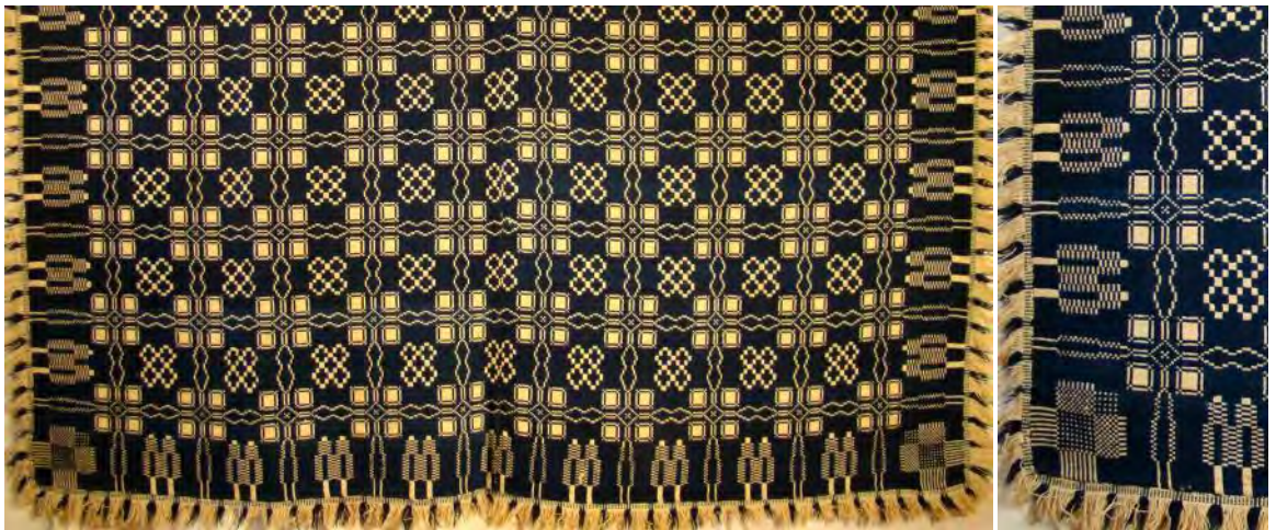
Blue and White Double Weave Coverlet with Pine Tree Border