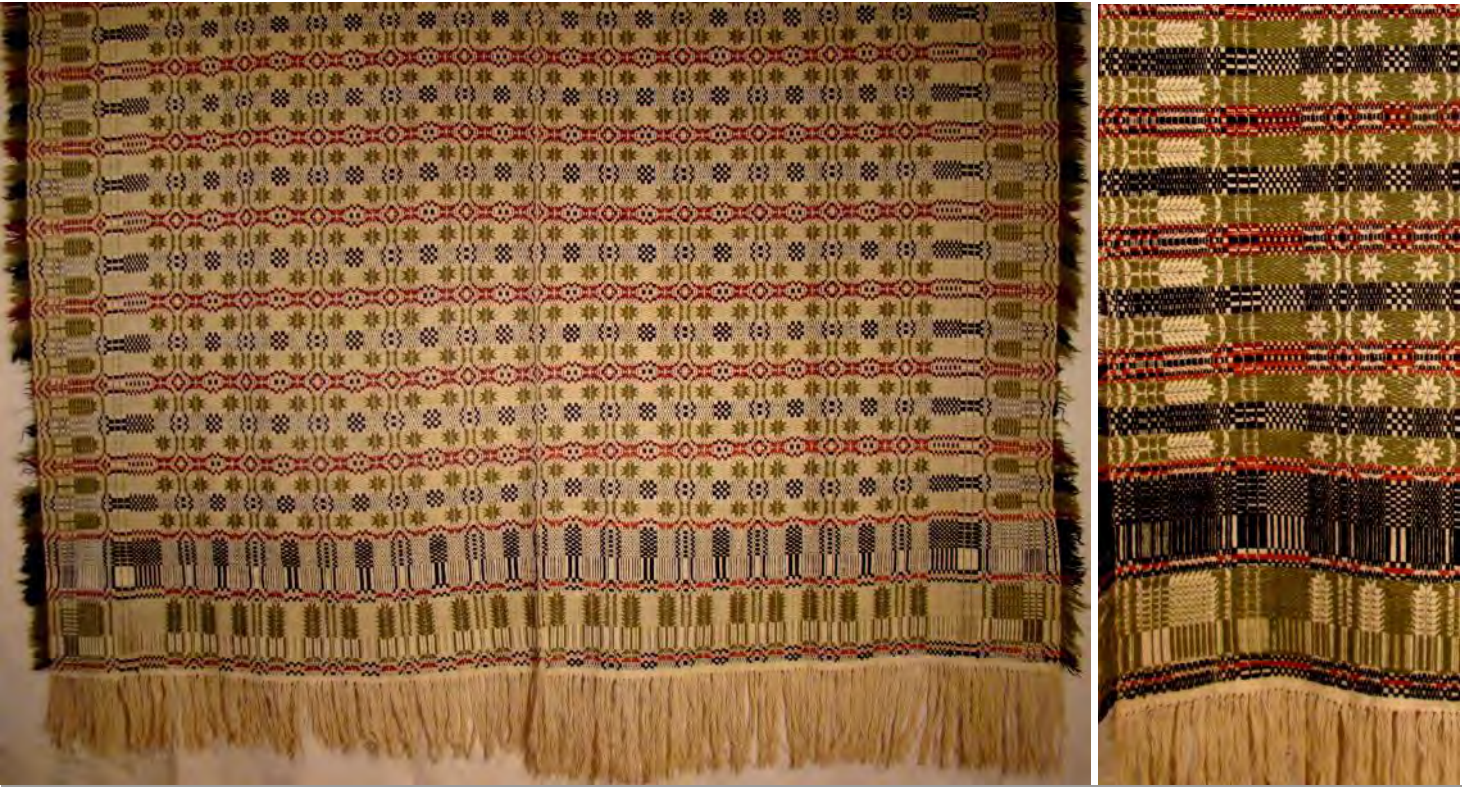
Red, Dark Blue, Green and White Point Twill Coverlet with Four Stars and Rose Pattern and Double Pine Tree Border

A red, dark blue, green and white point twill coverlet woven in a four stars and rose pattern with a double pine tree border is shown above. This coverlet uses a lot more green wool filling than usual. Many of the Pennsyl-