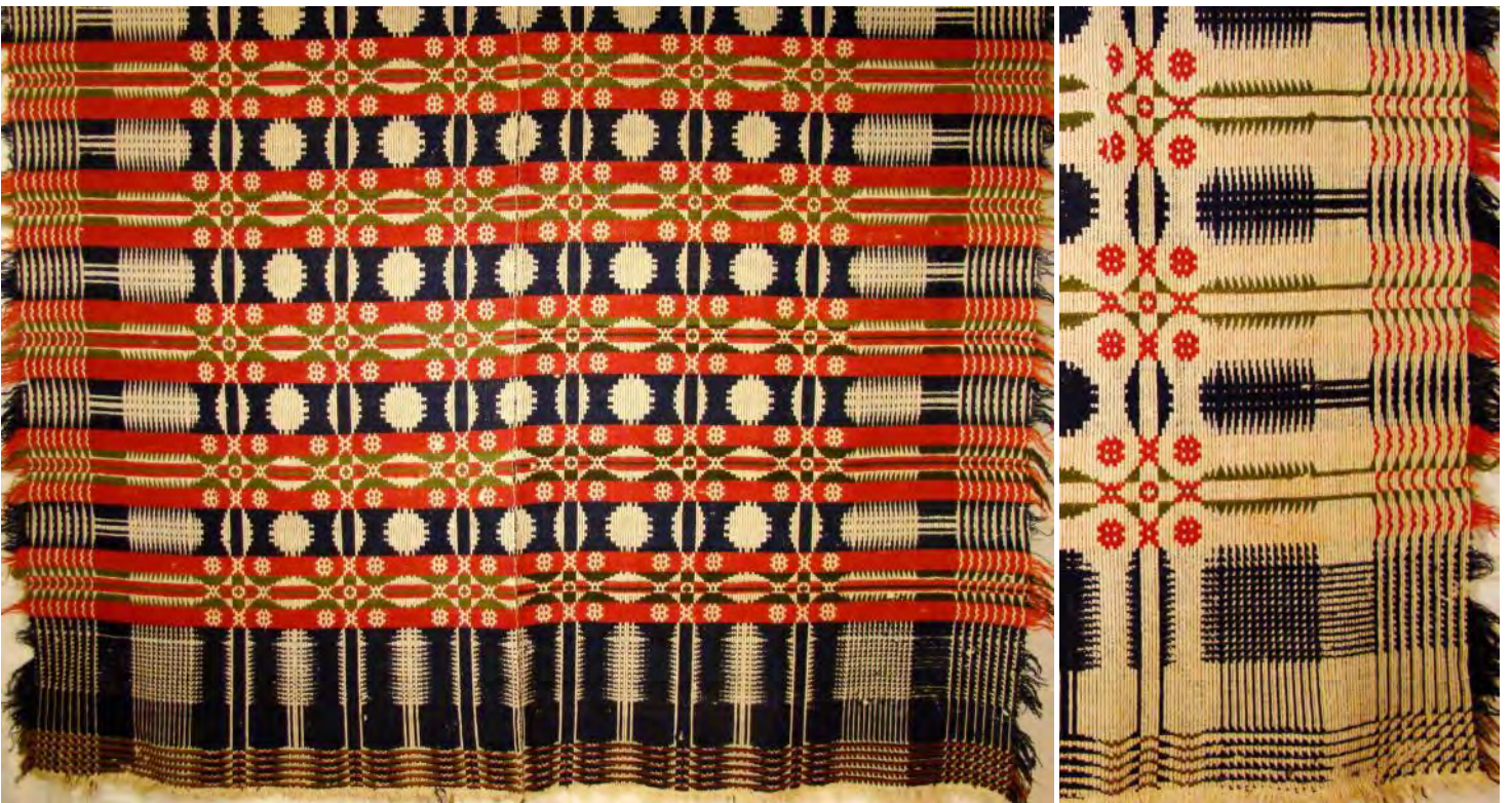
Red, Blue, Green and White Tied Beiderwand Weave Structure Coverlet with Pine Tree Border