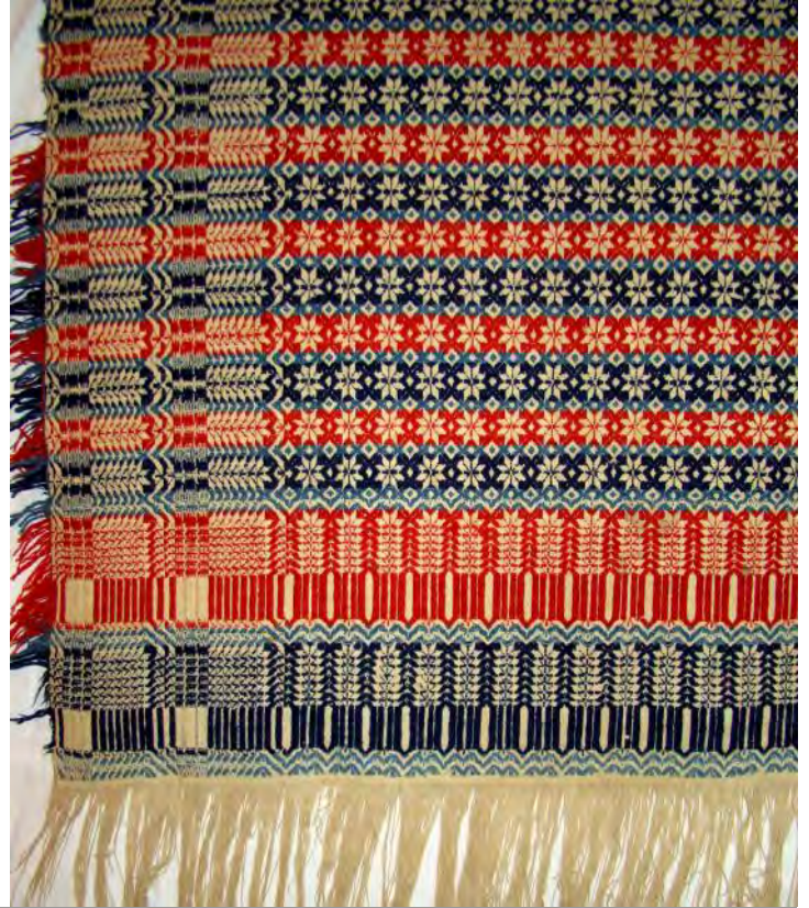
Red, Blue and White Point Twill Coverlet in a Star and Small Diamond Pattern with Double Pine Tree Border

A red, blue and white point twill coverlet woven in a star and small diamond pattern with double pine tree borders is shown above. The small pattern repeat makes the pine tree border look more like a forest.