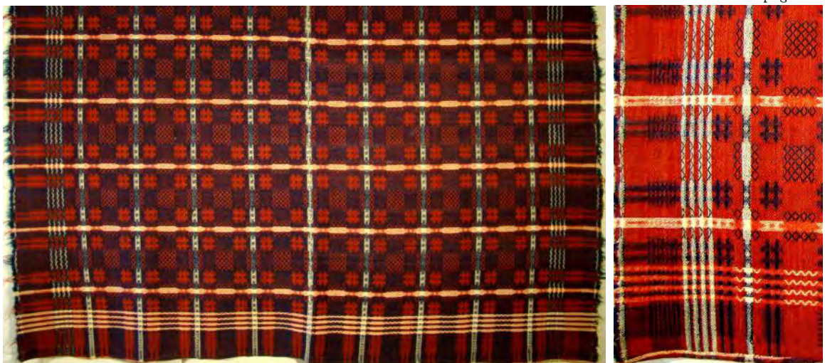
Red, Blue and White Coverlet with Pine Tree Border Woven in Gebrochen and Block Twill

A red, blue and white coverlet with a pine tree border woven in gebrochen and block twill is shown below. This weave was called gesteinte and gebrochene (block and broken) by the German weavers but is called a "combination" weave by the PA German weavers. A similar coverlet is shown on page 207, Volume 2 of The Coverlet Book by Helene Bress. Thanks to Gay McGeary for help in describing these coverlets. continued on page 3