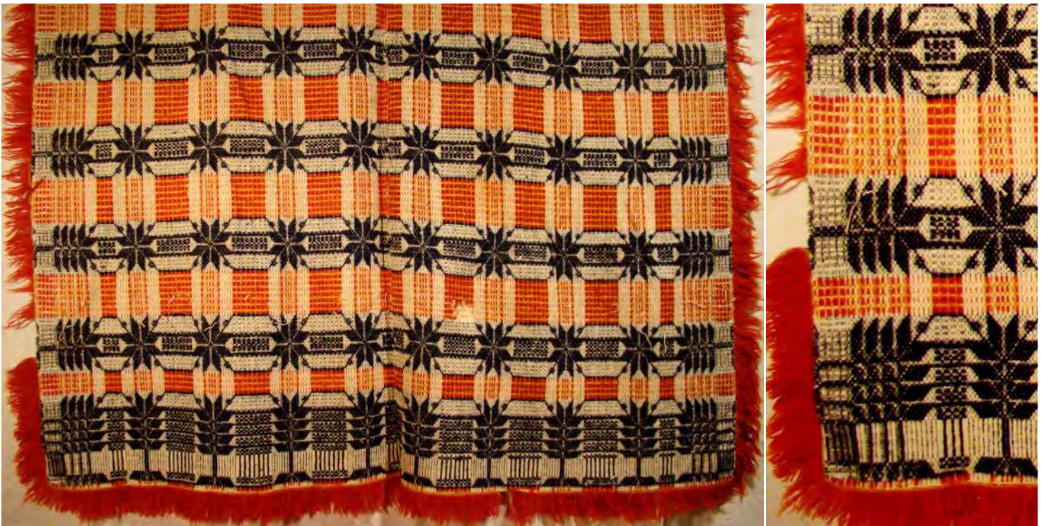
Red, Black and White Complex Weave Coverlet with Pine Tree Border

This complex weave coverlet appears as black and white bands of star work stars separated by a red and white band of overshot tables. The coverlet has an applied red wool fringe.