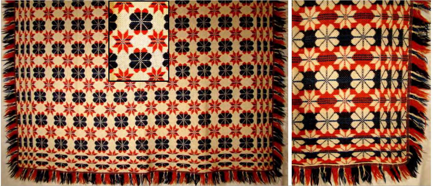
Red, Dark Blue, Light Blue and White Star Work Star and Blossom Pattern Coverlet

A red, dark blue, light blue and white star work coverlet woven in a star and blossom pattern is shown above. The weaver's sparing use of the light blue filling to highlight the center of the stars and blossoms adds to the beauty of this coverlet.