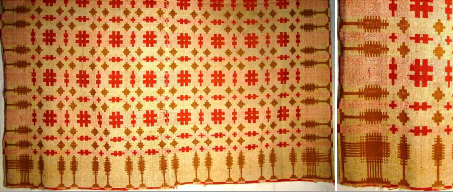
Red, Gold and White Summer Winter Weave Structure Coverlet with Pine Tree Border

The summer winter coverlet is named for the weave structure, not the fact it has a light and dark side. When examined close up this weave structure looks like a brick wall. It is unusual to see a summer winter coverlet with a border and woven with red and gold dyed wool weft. Most summer winter coverlets are either blue and white or red and white.