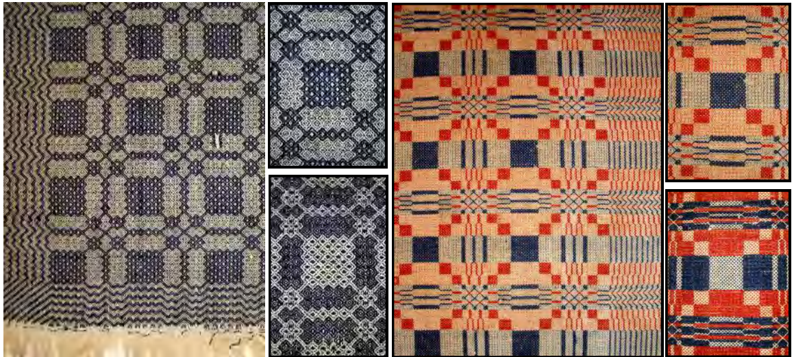
Blue and White Gebrochen Weave Coverlet