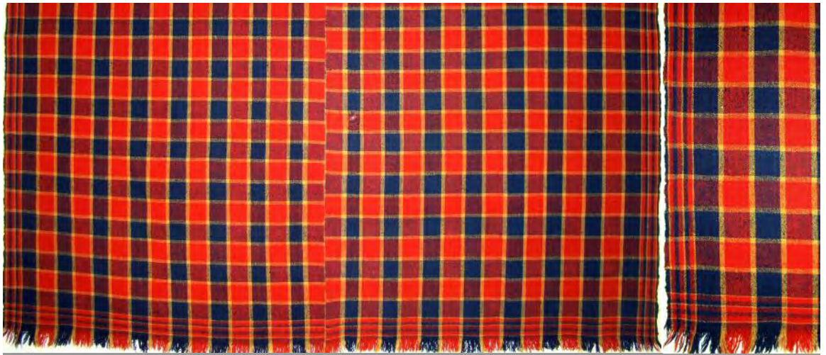
Red, Blue and Yellow all Wool Plain Weave Geometric Coverlet ex. Barbara and Lester Breininger collection