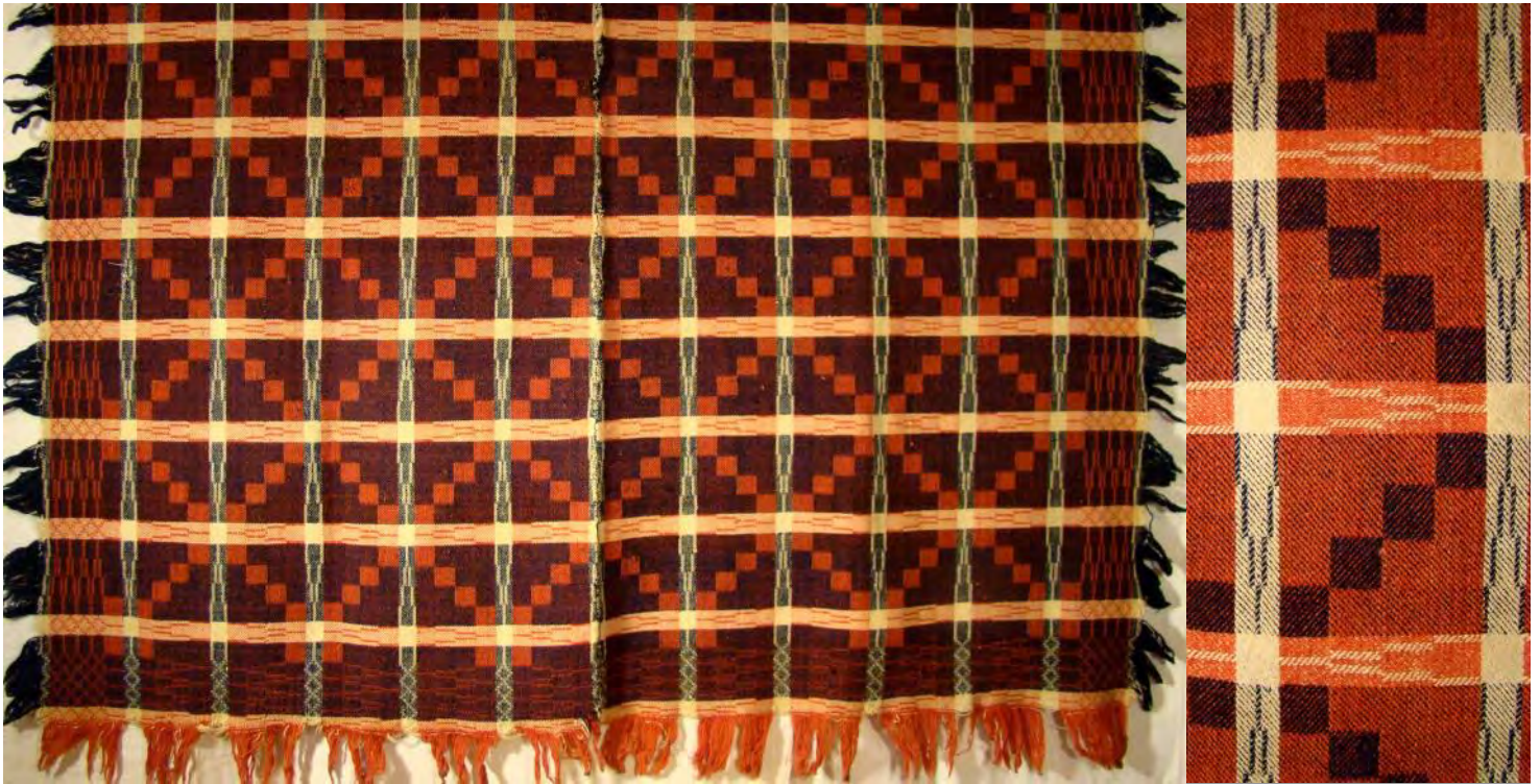
Red, Blue and White Twill Coverlet

The twill coverlet can be recognized by the diagonal lines that can be seen when examining the coverlet close up. The diagonal lines are formed by the weave structure.